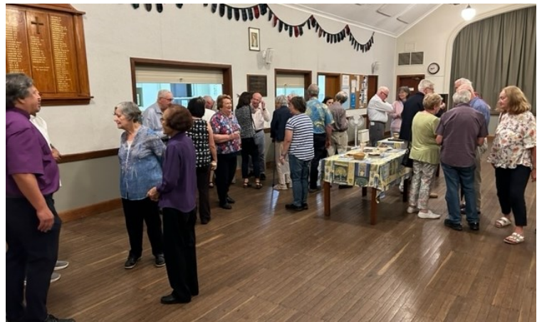
Above: supper following last Tuesday's Lenten Ecumenical Service at Killara Uniting Church.