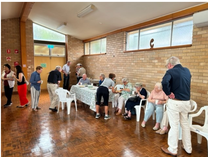
Above: morning tea in St Joseph's Hall at Killara after last Friday week's Healing Mass.